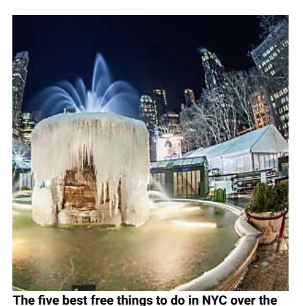
next seven days (https://www.timeout.com/newyork/blog/thefive-best-free-things-to-do-in-nyc-over-thenext-seven-days-122016?origUrl=true)